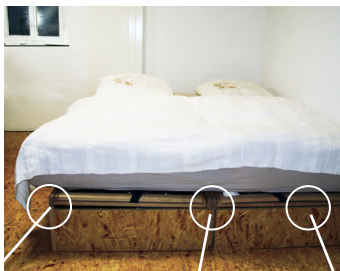
Bed bugs Traces of faeces Eggs

Talk about the measures with the head of the accommodation centre. It is then usually the case in an accommodation centre for asylum seekers that the centre itself pays for the treatment. If you are a tenant in a rented flat, you will normally have to pay for the eradication measures if you cannot prove that the apartment was already infested before you moved in.